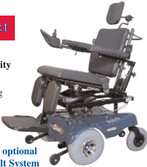
Shown with optional Equalizer Tilt System