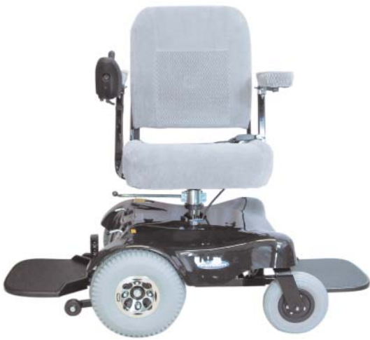
Convertible with Dual Footplates Height, Length & Angle adjustable

The PaceSaver Scout M1 power base helps you enjoy an exciting, invigorating pace. Enabling you to spend more time doing things that you enjoy with family and friends. The American made M1 Convertible™ is the most advanced power base of its kind.